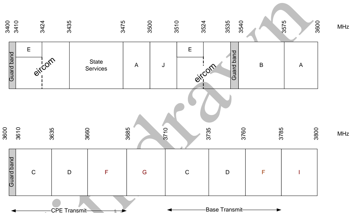
Figure 1: Channel plan for the 3.4 GHz – 3.8 GHz frequency band.

ComReg has identified 3 channels in the 3.6 GHz – 3.8 GHz part of the spectrum which will be made available under the existing FWALA licensing scheme. The channels are labelled Channel F, G, and I in Figure 1 below. Channel F, consisting of 2 x 25 MHz of spectrum can be used to deploy either FDD or TDD technologies. Channels G and I, which consist of 25 MHz and 15 MHz of spectrum respectively are identified for TDD deployment only 3 . A further channel (Channel J) is currently reserved for the National Broadband Scheme 4 . Licences will be issued under the Wireless Telegraphy Fixed Wireless Access Local Area Licence Regulations S.I. No. 79 of 2003.