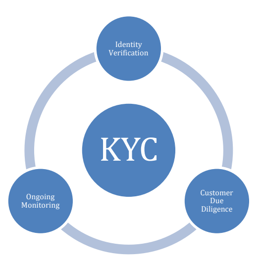
Figure 1: Key components of KYC Frameworks

29. All effective KYC frameworks are made up of three key components: identity verification, customer due diligence, and ongoing monitoring (see Figure 1).